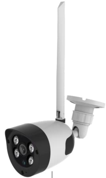
Door to Access: Micro SD Card Slot and Reset Button